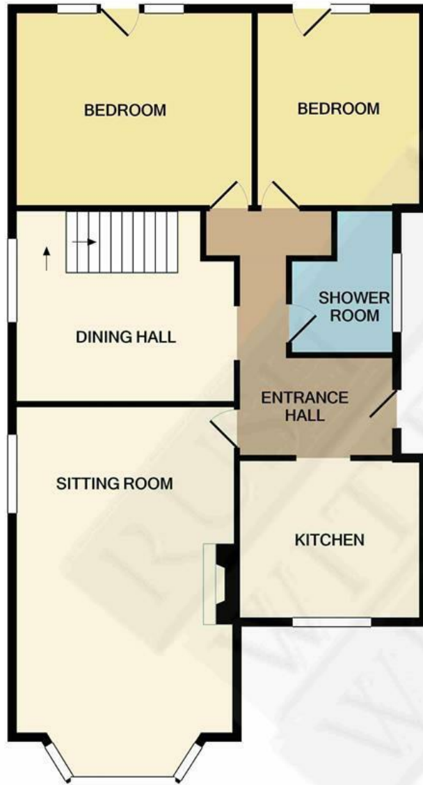
GROUND FLOOR APPROX. FLOOR AREA 796 SQ.FT. (74.0 SQ.M.)